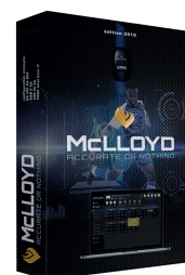
Software Sport Tracking

STv4 is a complete tracking system for Strength & Conditioning coach looking for performance :