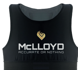
Tank top with GPS pocket Sport Tracking XS-XXL