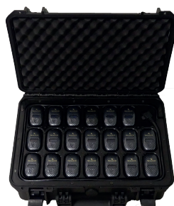
Charging Case for 20 trackers